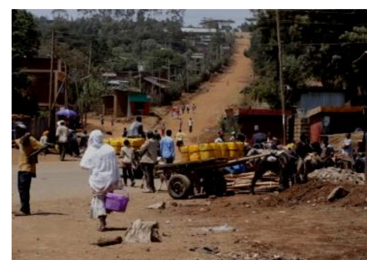
Donkeys and water carts in Hossana town