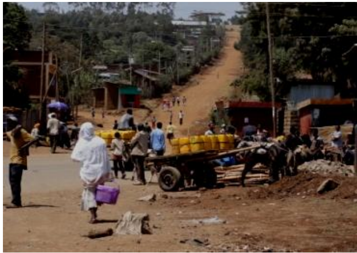
Donkeys and water carts in Hossana town