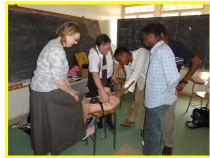
Top – a difficult breech delivery Middle – the trainees celebrate Bottom – chest drains and tracheostomy in a sheep carcass